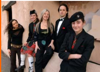
Mac Talla Mor

Complete series information available on our website, www.romeart.org