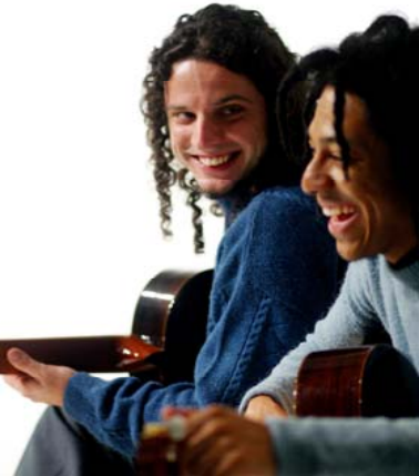
Brasil Guitar Duo

Contact Rome Art And Community Center Via phone, in person, or web